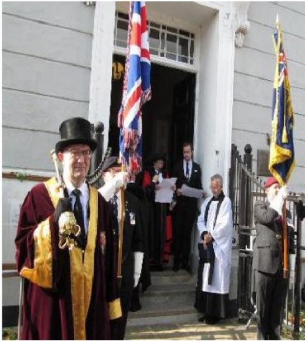
Left: The Proclamation of a new King in Sudbury.