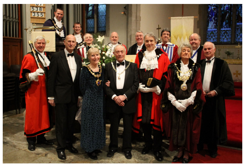
Henley-in-Arden court Leet.

The President and Warden for the North West with the new "Freewomen" of Carlisle.